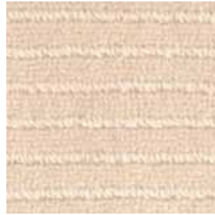
posh - off white 7757